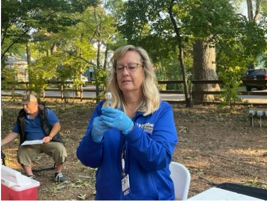
A Beebe Healthcare nurse prepares a vaccine during the AIDS Walk Delaware event in Rehoboth Beach.

Rehoboth Beach has a strong LGBTQ+ community, who Beebe has been proud to serve for inclusive, patient-centered healthcare needs for many years. As the virus spread, many were looking for answers. Beebe held a virtual town hall for all communities and partnered on vaccination events for those who met criteria. Beebe partnered with CAMP Rehoboth and the AIDS Walk Delaware event held in Rehoboth Beach in September 2022 to provide vaccinations.