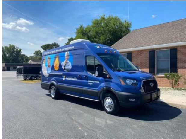
TidalHealth Nanticoke's mobile medical van.

Additionally, TidalHealth Nanticoke is investing in population health strategies to promote health equity by building a Community Wellness team for Sussex County. The hospital received grant funding to purchase and outfit two mobile medical vans for mobile health screenings such as diabetes risk assessments and blood pressure checks as well as for point-of-care testing in hard-to-reach underserved